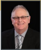
Member Services Manager