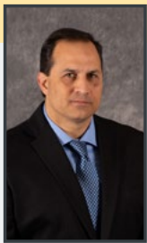
Member Services Manager