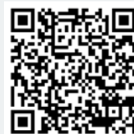
Google Play Store

Scan one of the QR codes below with your mobile device for your app store.