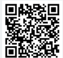
Apple App Store