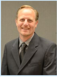
Engineering & Operations Manager

On May 11 th , a Lisbon Substation transformer bushing flashed over and caused an outage – that is the large insulator on the top of the transformer. There are three companies that are engaged to give us quotes for the complicated repairs. We will replace all three bushings to keep a matched set on that transformer and keep the others we removed as spares. They can be used in the future on our other similar transformers. Lisbon currently has our trailer mounted spare installed and carrying load reliably. If you drive by that substation south of Montevideo on old Hwy. 59, you will see both transformers inside the fence. A spare substation transformer is a very expensive asset to keep around, but necessary in the case of a Sunday afternoon outage like this.