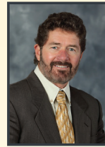
Manager of Engineering & Operations

When we live in Minnesota, we deal with all sorts of weather. The cold temperatures and the white stuff definitely found us this past month. When this happens, we shift into line patrol duty. P two zero two zero two If you see our trucks in your yard, or going slow on roads, they are just looking at the condition of wires, checking clearances to trees and buildings, and looking out for any problems that might need to be addressed.