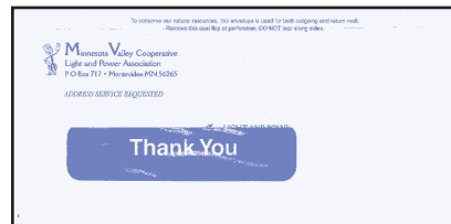
The front of your billing envelope (Yellow envelope with blue accents)